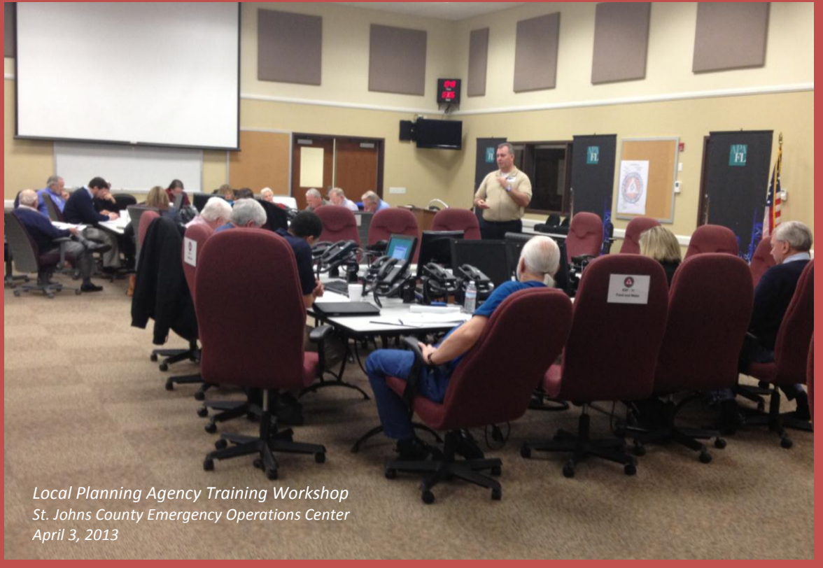
Local Planning Agency Training Workshop St. Johns County Emergency Operations Center April 3, 2013