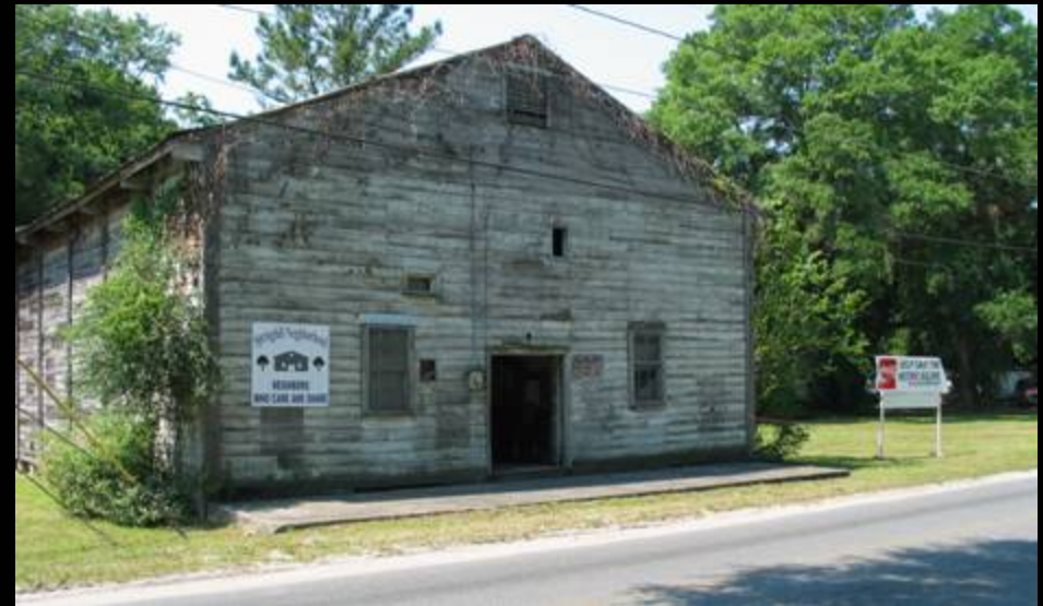
The Cotton Club: An Eastside Cultural Landmark